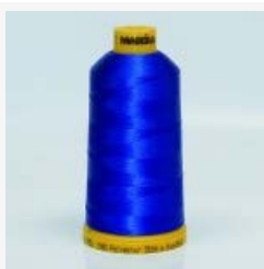
The yellow MSC for Polyneon 75 makes it easy to recognize the thread count on the embroidery machine